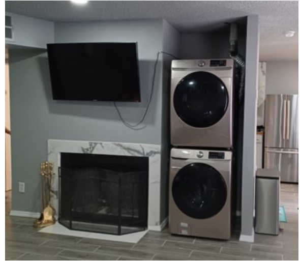
7/10/22 Interesting decor in the airbnb which Carolyn Thompson's sister is renting in Albuquerque

they had a gorgeous view of the mountains. During their leisurely meal they watched as the setting sun first lit up the top of the range and then moved down the side. They thought it was gone but then saw it light up all the bright green trees down at the base of the range.