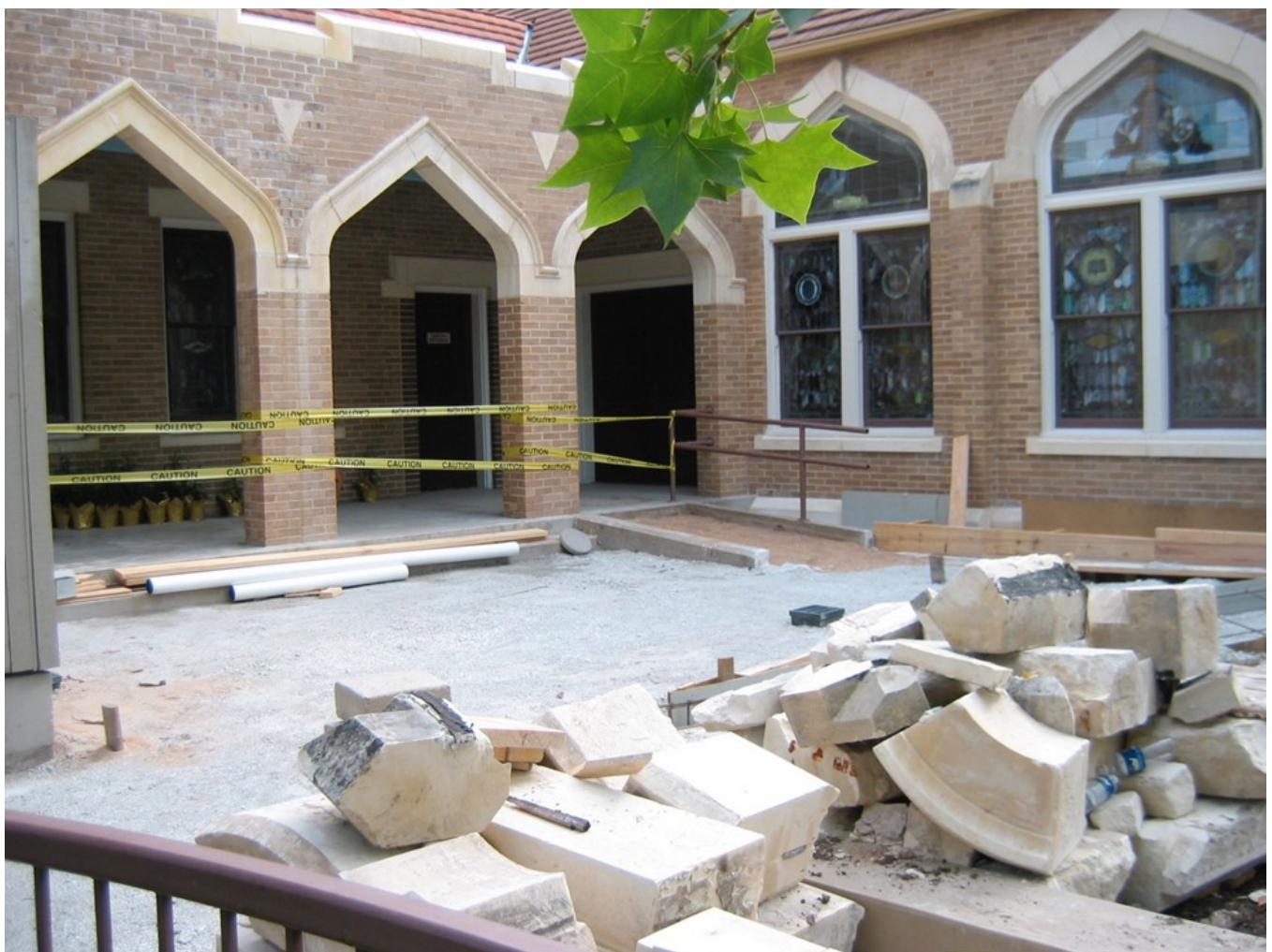
4/29/07 Courtyard construction/rebuilding of arches at the church

During 2007, we did a major remodel of the courtyard, redoing some of the arches, working on the porch, and making church entrances more accessible. Don Brown supervised the project. From the 2007 Annual Report , "By January, 2007, after completion of the new kitchen, restroom, nursery, storage area, renovated children's play area and measures to protect against rainwater damage, it was clear that more funding would be needed for the walkways, ramps, drainage improvements, and beautification of the garden area and entrances to the church building. In March 2007, the congregation agreed to invite additional contributions to finish Stage 1. Pledges and donations again poured forth. Consequently, thanks to the fine work and generosity of the congregation, architects, contractor, subcontractors, minister, church staff and friends, Stage 1 was completed in December 2007. The total cost was approximately $140,000."