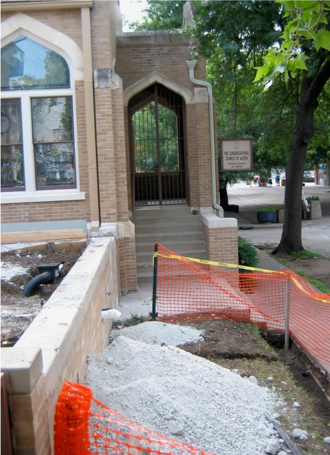
4/29/07 Courtyard reconstruction and creating a more accessible entrance to the sanctuary