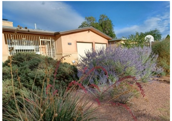
7/7/22 A beautiful xeriscape yard in Albuquerque