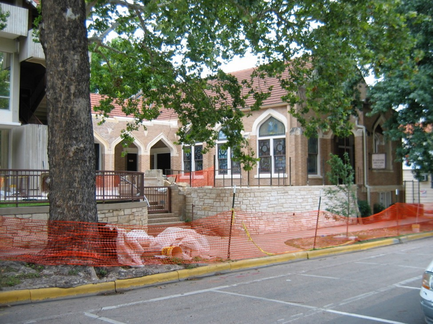
5/27/07 Continuing work on the exterior and the courtyard of the church